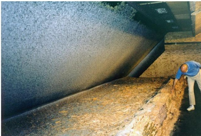
Figure 1 - A Plate and Pit Bullet Stop

3.4.2 Escalator bullet stop (Figure 2). The escalator bullet stop has sloping steel surfaces to guide the bullet into a location where the projectile's energy can dissipate safely. The bullet travels up the surface of the plate to either a "swirl" area or deceleration chamber. Due to friction or multiple impacts, the bullet loses energy, then falls into a tray for later collection.