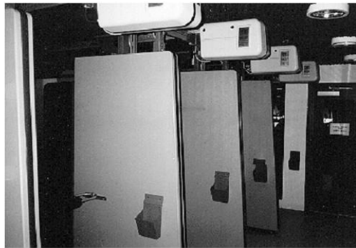
Figure 3 - Shooting Booths

3.9 Rubber mats may be used for prone or kneeling firing positions. They should have tapered edges (to avoid tripping) and should be easily cleaned. Mats should be stored out of the way when not in use.