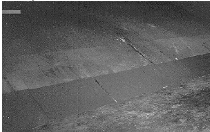
Figure 2 - Escalator bullet stop

3.4.2 Escalator bullet stop (Figure 2). The escalator bullet stop has sloping steel surfaces to guide the bullet into a location where the projectile's energy can dissipate safely. The bullet travels up the surface of the plate to either a "swirl" area or deceleration chamber. Due to friction or multiple impacts, the bullet loses energy, then falls into a tray for later collection.