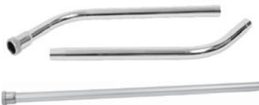
Wands & Extensions