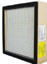
HEPA Filter 99.97+% VF-HE03