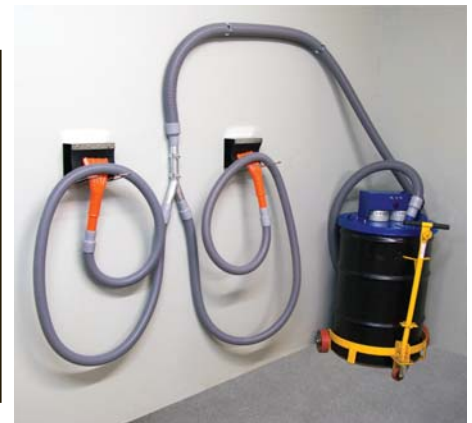
Personnel Vacuum Station Custom solutions available

Hoses can be supplied with or without cuffs in single lengths up to 50 feet. Swivel cuffs are standard except on type S hose. Additional hose types and diameters are available.