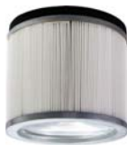
Pleated cartridge (MERV 12) Spunbond Polyester Media VF-301