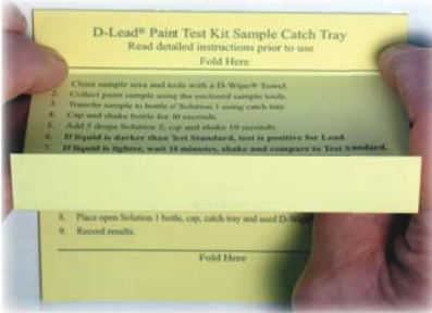
Fold Sample Catch Tray