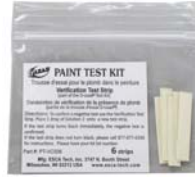
Verification Test Strips