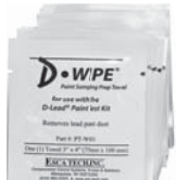
Individually wrapped D-Wipe® Towels