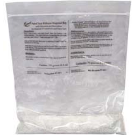
Waste Disposal Bag

Gloves, eye protection and hammer not included.