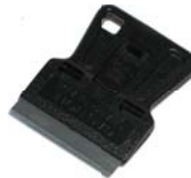
Razor Blade with handle