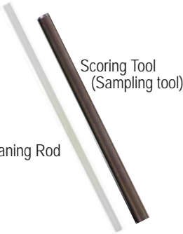
Scoring Tool (Sampling tool)