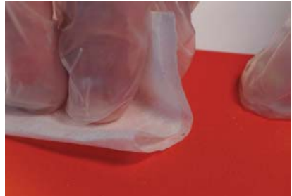
Clean sample area and tools