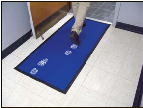
D-Step™ Mats remove up to 98+% of contaminants from the bottom of shoes and wheels