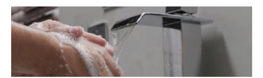
Wash your hands with soap and water or alcohol-based hand rubs containing at least 60% alcohol.