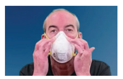
If your respirator has a metal nose clip, use your fingertips from both hands to mold the nose area to the shape of your nose.