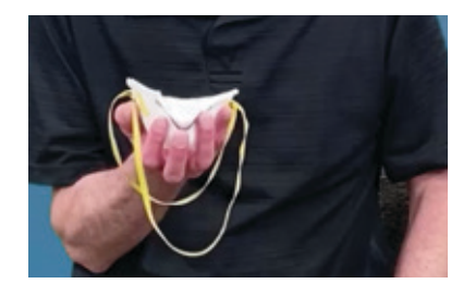
Cup the respirator in your hand with the nosepiece at your fingertips and the straps hanging below your hand.