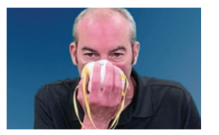
Cover your mouth and nose with the respirator and make sure there are no gaps (e.g., facial hair, hair, and glasses) between your face and the respirator.