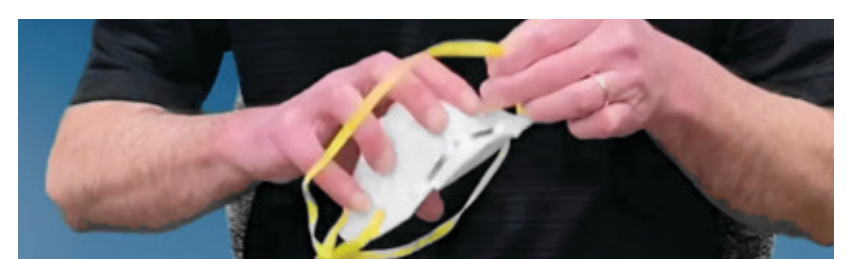
Inspect the respirator for damage. If it appears damaged or damp, do not use it.