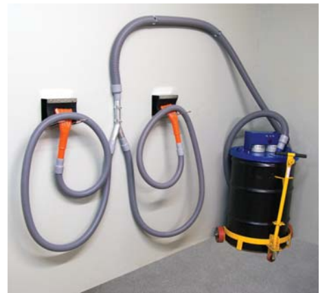
Personnel Vacuum Station Custom solutions available

Additional hose types and diameters are available.